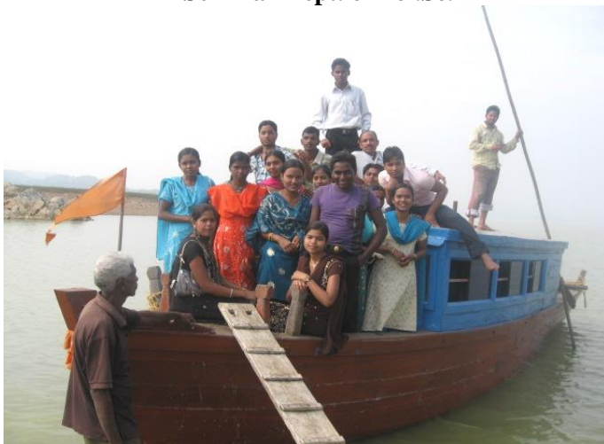
Study tour Commerce stream