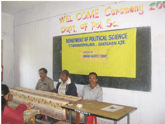
Seminar Dept. of Pol.Sc.