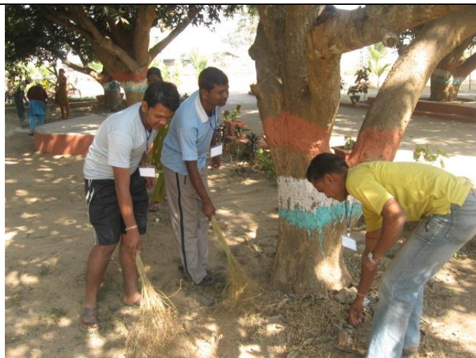
Campus Cleaning by N.S.S.