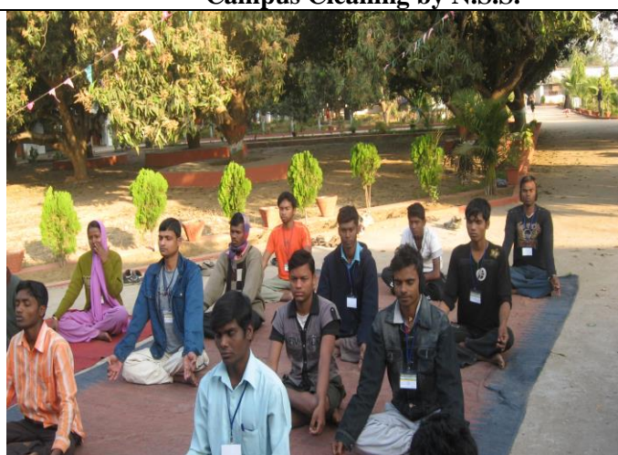
Practice of Yoga