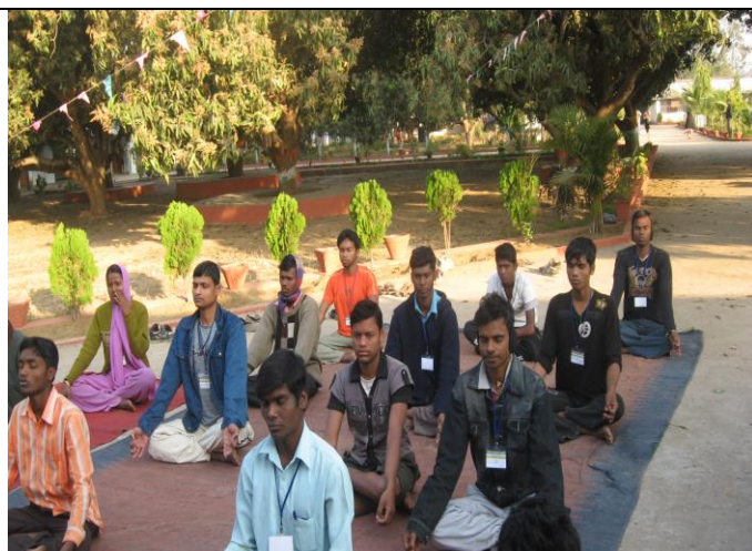
Practice of Yoga