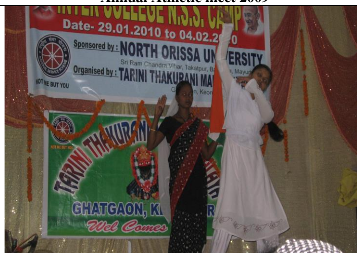
Cultural Programme - Inter College N.S.S. Camp