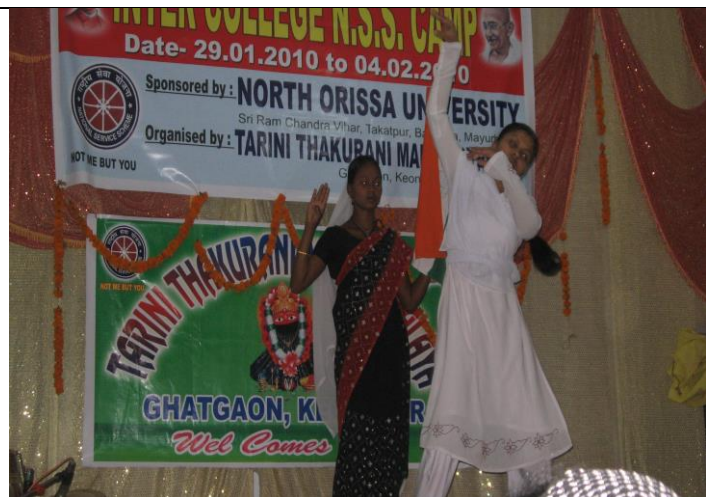
Cultural Programme - Inter College N.S.S. Camp