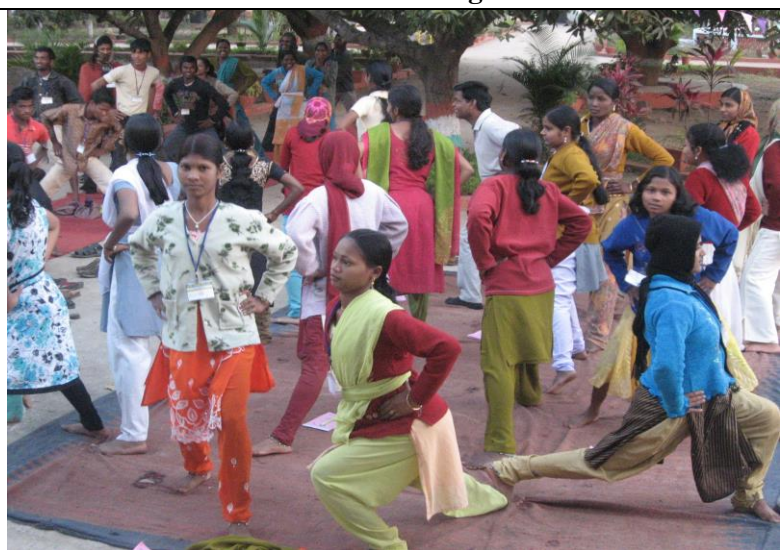
Fitness Programme by N.S.S.