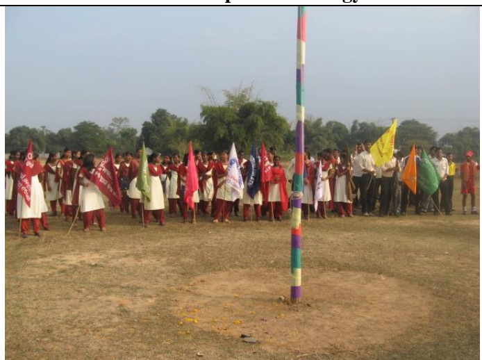
Annual Athletic meet 2009-10