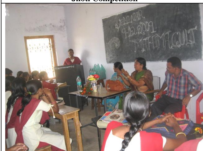
Seminar Dept. of History