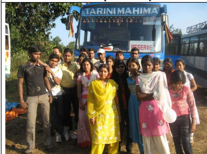
Study tour of Science Stream