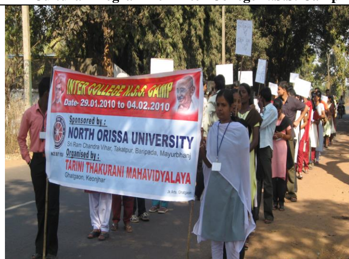
Awareness Programme- Inter College N.S.S. Camp