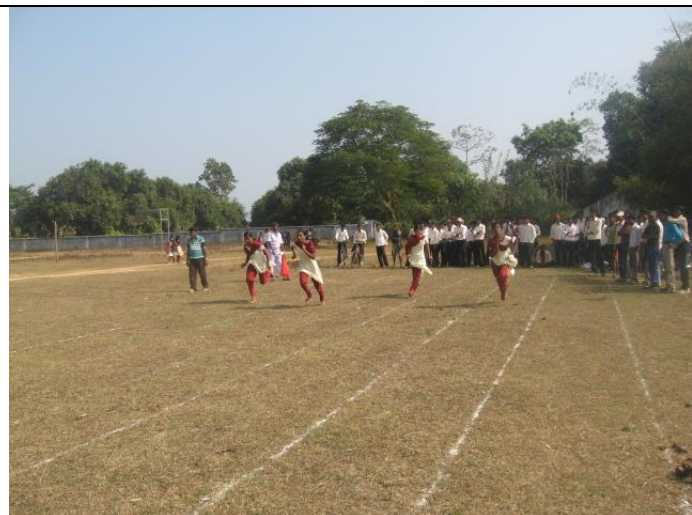
Annual Athletic meet 2009