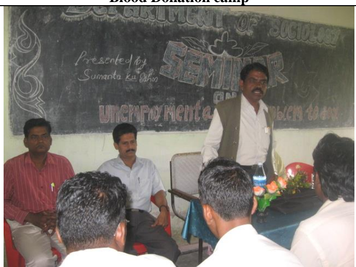
Seminar Dept. of Sociology