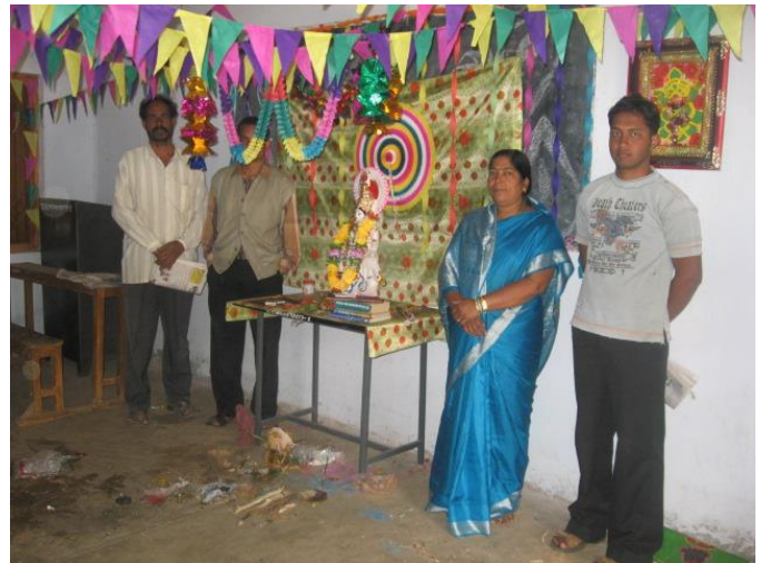
Saraswati Puja Dept. of History