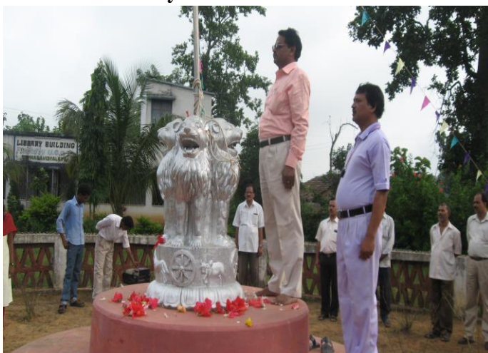
Celebration of Independence Day