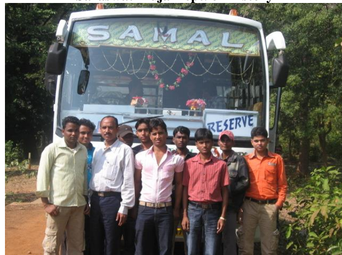
Study tour Dept. of History & Economics