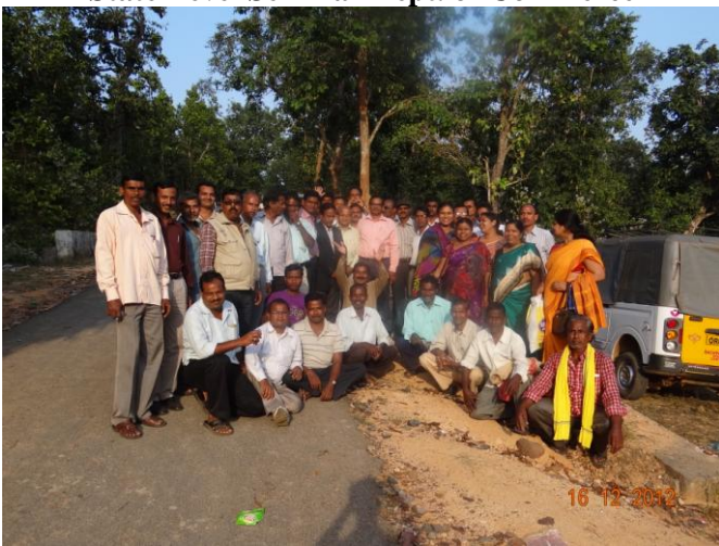
Study tour of Deptt. of History