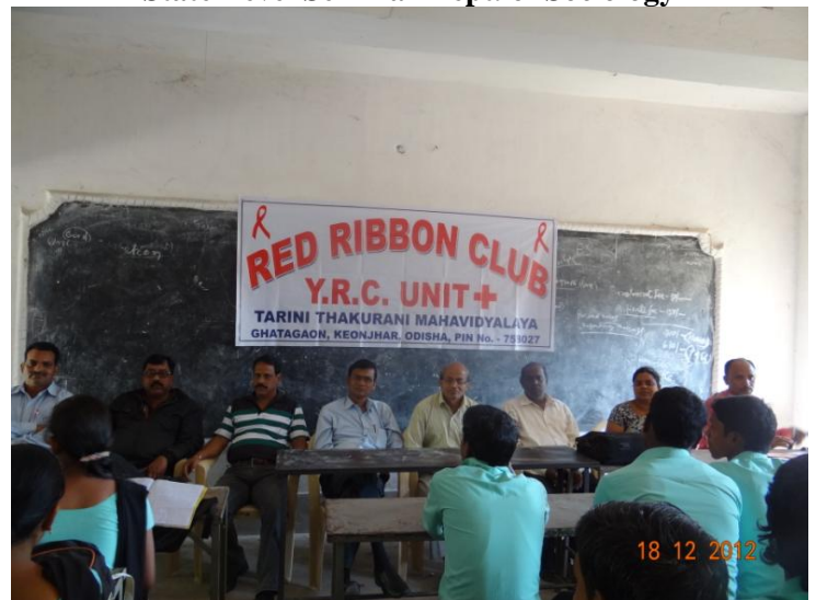
Red Ribbon Club