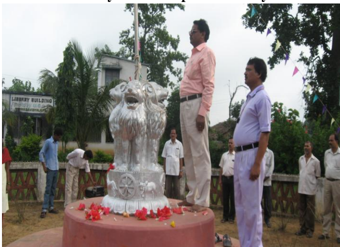
Celebration of Independence Day