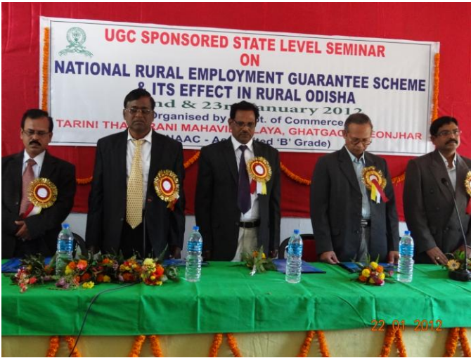
State Level Seminar Dept. of Commerce