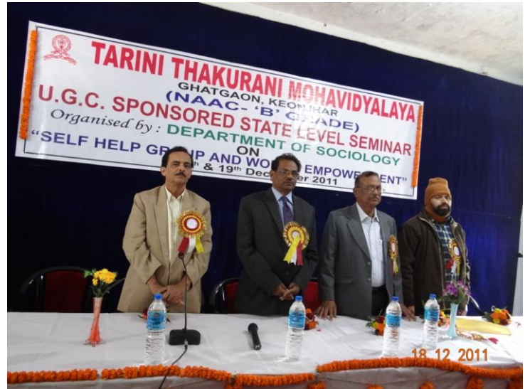
State Level Seminar Dept. of Sociology