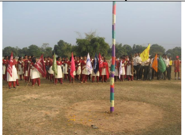
Annual Athletic meet 2011-12