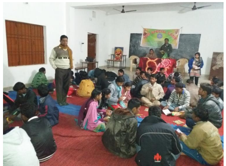
Special Camp of NSS