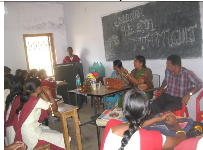
Seminar Dept. of History