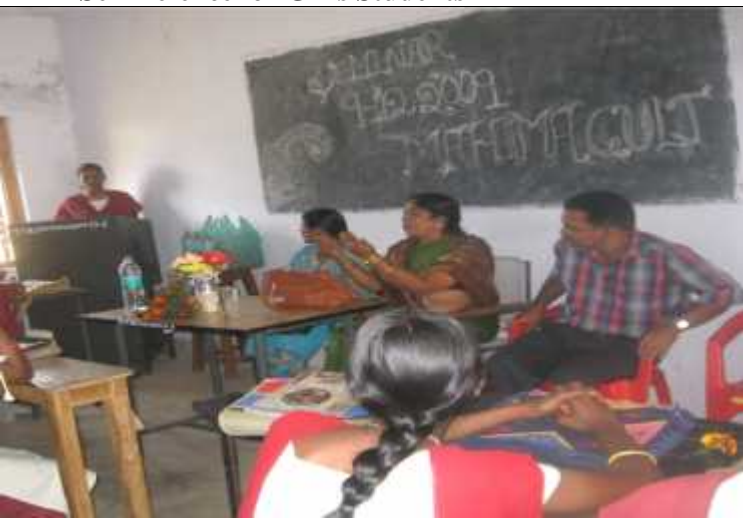
Seminar Dept. of History