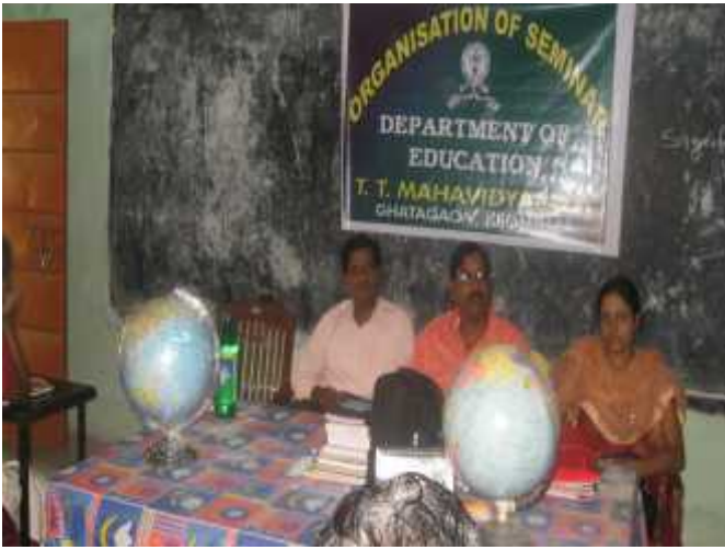
Seminar in Dept. of Education