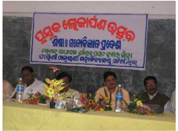
Pustaka Lokarpana Ceremony