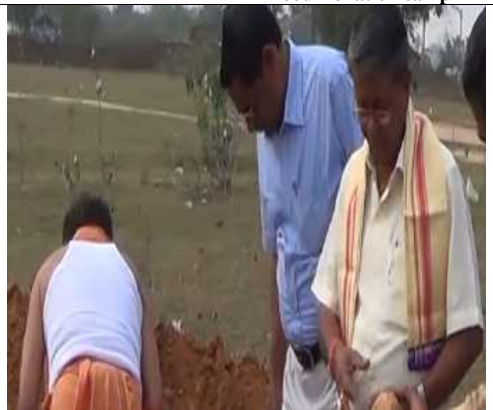
Bhumi puja for Ladies Hostel