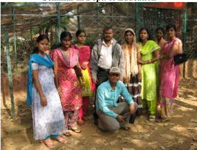
Study tour of Deptt. Education