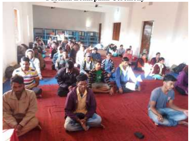
Yoga Class in NSS Camp