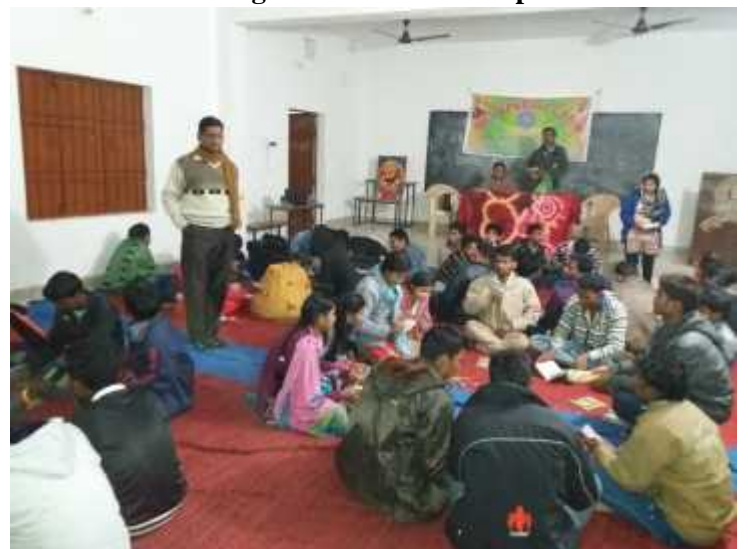
Special Camp of NSS