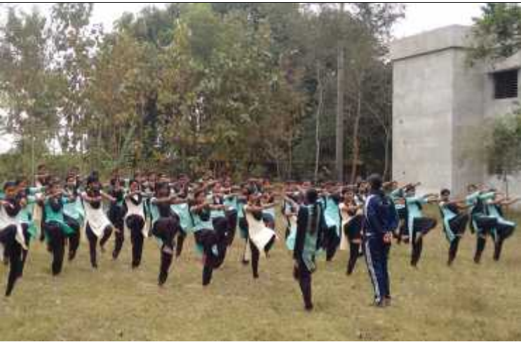
Self Defence for Girls Students